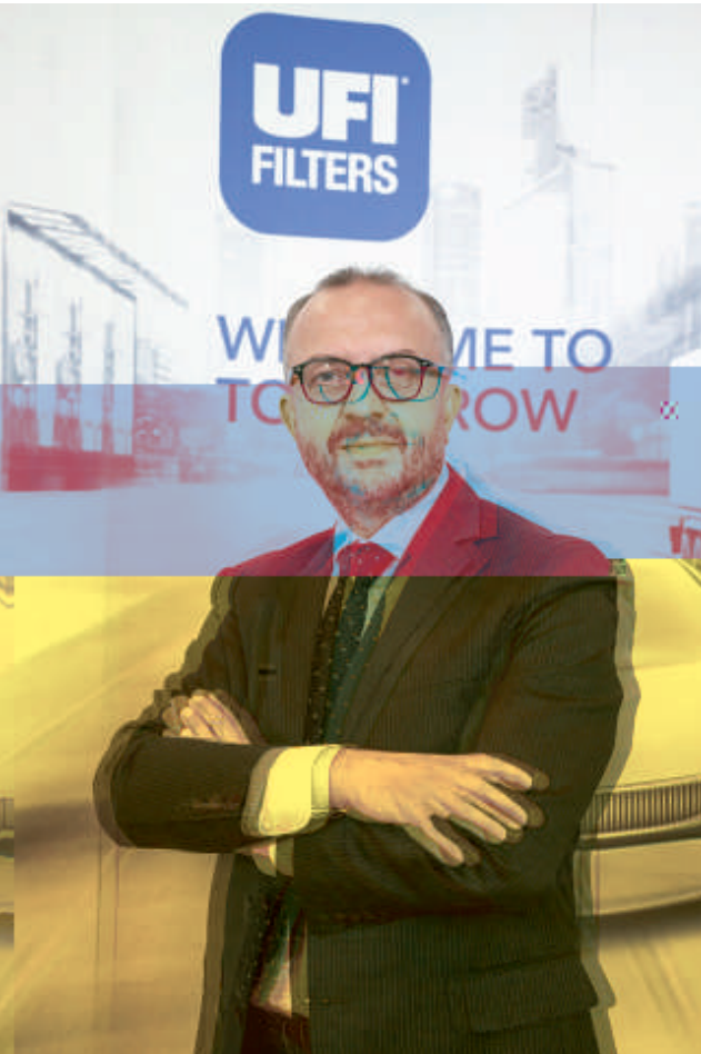
$&0 PG 6* 'JMUFST (SPB\O\J\O\B\MEP ')

&K Q D L V W K R Z P D U N D I X W R P D N U H U L Q W K H Z R U O G O R R N V D W ; U V W Z L W K I R Y L Q H Z H K L F E D H Q R E Q V K P H D O D B G F K D U G(7/)"#+/2F)&#%&#0#.#B7/0F.&#.#9(7""7+%#)#%#.#2#%&#%#( )#7&# "%#)"#%&#&#.-C7/0#L#2+)))*#7/#7#F.&#)*#F%/*7/0#)/C7&.F)'# %2'.F%#H)8#2"#@#)&#%#/#B(%#)7&#2".F)&#B#%/1#6/#(7"# B%3#( )#G(7/)"#++&#F%&H)#7#)#@).F7/0#( )#&#F%&#)+.F9-#D# '(%#.#&'(#F)7+/#2 &.9)#%/*#N%9#07C)#)#F%#( )#07./%#%#*# )0F)'# *7$&#( )#)#!#"#%#/#)D)+2'7C)#7#/#)"#%&3#2#)*&#%#/#( )#